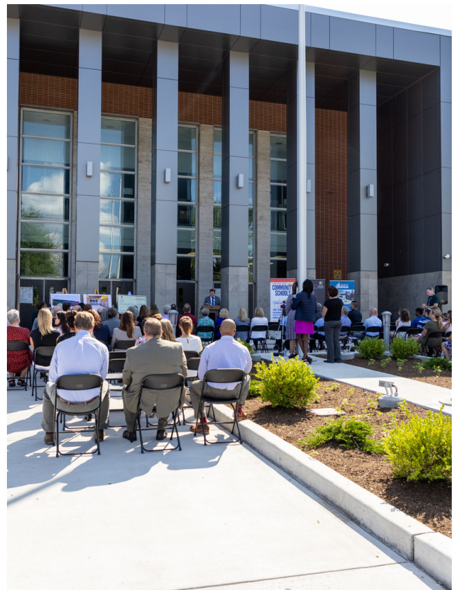
Guests gather for a press conference outside the renovated exterior facade of Erie High School.

The district is using $553,800 in pandemic relief dollars to fund the work.